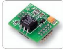
RS-485 Communication Module