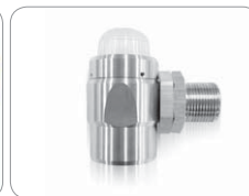
GTL-100 (Flame Proof Type Alarm device)