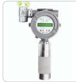
Alarm Beacon Type (Alarm device)